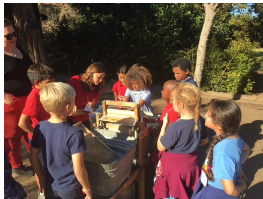
Photo: Students washing laundry by hand during a Rancho Los Cerritos field trip

The five-week-long after-school program, started in 2018, teaches second and third-grade students about local and California state history. In the classroom, children interact with artifacts, photographs and documents from the Rancho Los Cerritos collection. Students also take part in a field trip to the Rancho that includes a tour of a 175-year-old adobe home. While on-site, students are immersed in 1800s-era life by participating in such activities as candle making and doing laundry by hand.